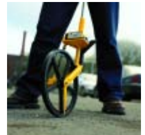
Dual reading model available.